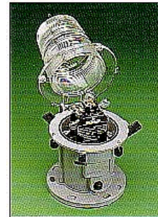
TF-3AC in ML-155 MaxLumina® marine signal lantern.

The motor-driven lampchanger automatically relamps after each lamp burnout.