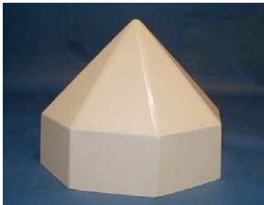
OCTAGONAL HEAVY DUTY POLYETHYLENE PILE CAP ITEM NO. 11-035xxOCT