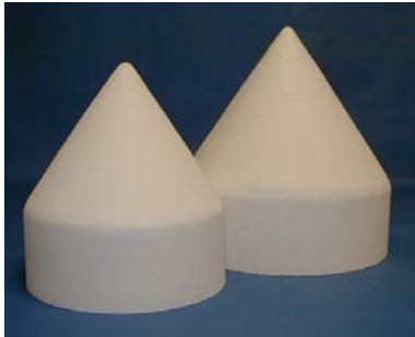
ROUND HEAVY DUTY POLYETHYLENE PILE CAP ITEM NO. 11-035xx

Constructed of thick, heavy-duty polyethylene, with 1/8" minimum wall thickness, for long lasting protection. Furnished in white, other colors available, including gray granite, on special production with an upcharge.