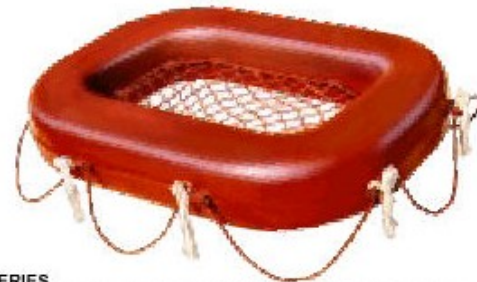
1200 SERIES LIFE FLOATS